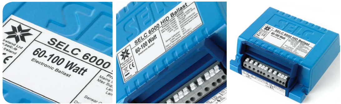
Long Life Electronic Low Frequency Smart Ballasts