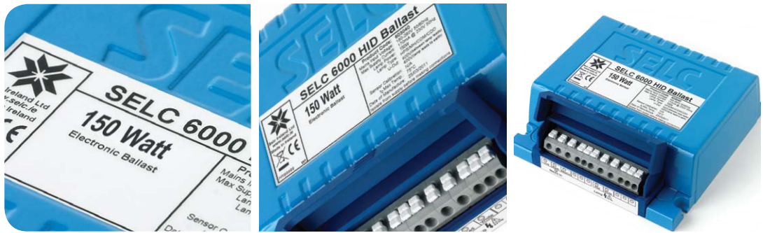
Long Life Electronic Low Frequency Smart Ballasts